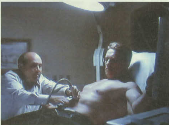
FILM STILLS FROM JUNIOR , 1994: (ABOVE LEFT) DANNY DEVITO PREPARES TO IMPREGNATE ARNOLD. (RIGHT) ARNOLD'S NIGHTMARE CHILD.

Lang couldn't sustain a double legacy, that of the two most famous Austrians of the twentieth century, Freud and Hitler. Instead, he split for California. 9 But the Lang and the short of it is that the doubling that shadowed or guided him as an uncanny synchronization between his moves or movies and political events could not of course be taken interpersonally, was not restricted to his person, and indeed continues to come full circle. The experiment is on, only in California, no other place, concept, or field of representation could sustain it, to combine, incorporate, synthesize, or overcome the extremities named Freud and Hitler in an assembly line of intermediaries. Currently at the front of this line, Governor Arnold Schwarzenegger is the third famous Austrian—and we're out of the running of extremes